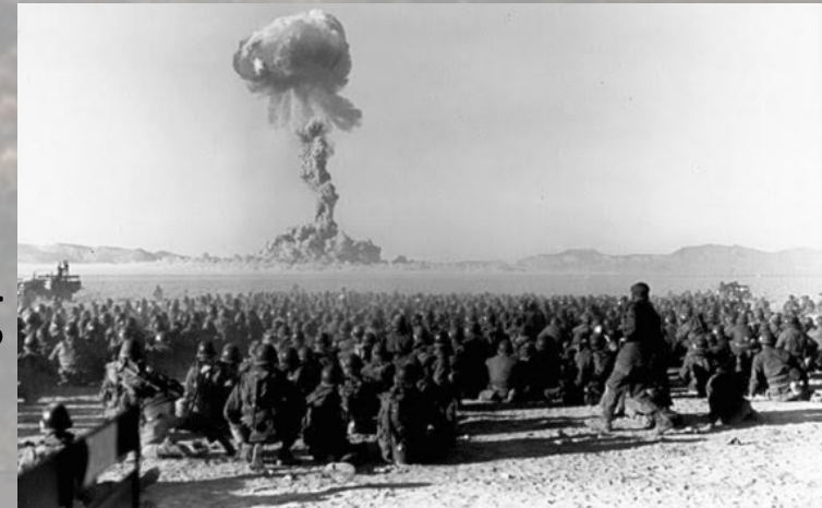
Nuclear test Orenburg/Totskoye 1954