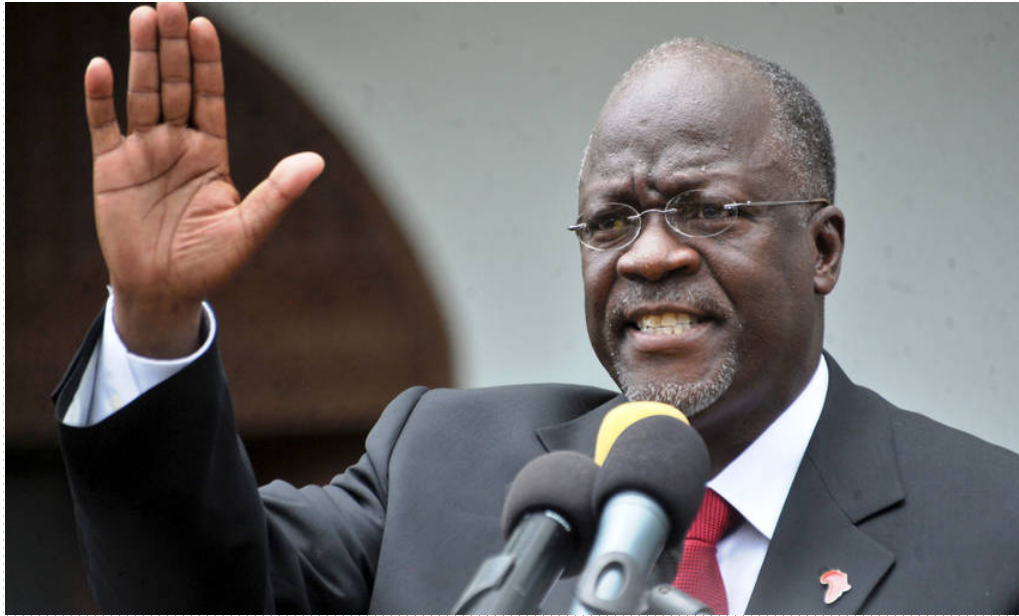
President of Tanzania (John Pombe Magufuli)