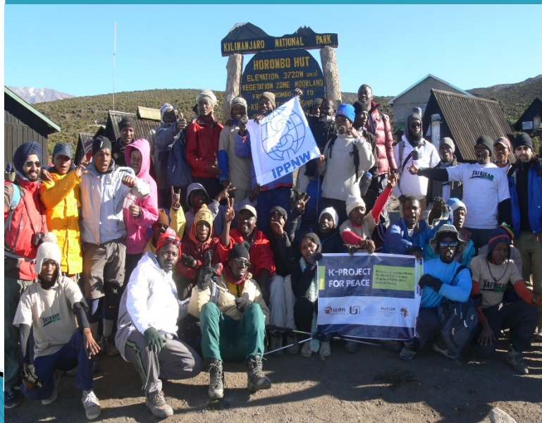
Campaigning on Nuclear Burn